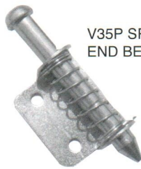
V35P SPRING END BEARING