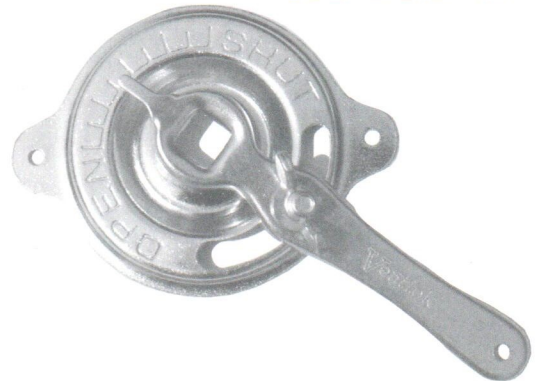
V35 VENTLOK 3/8" DIAL REGULATOR