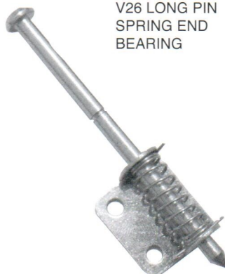
V26 LONG PIN SPRING END BEARING

This spring end bearing is designed for use on dampers in ducts insulated on the inside. The pin is one inch longer than our standard V20 spring end bearing, so that when released the pin extends 1-5/8" beyond the pin holder.