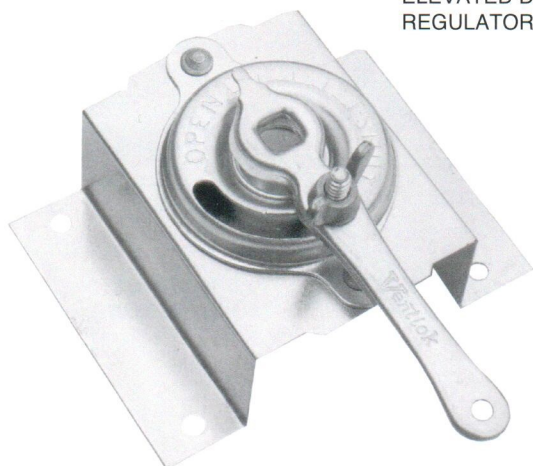
V27 VENTLOK 1/4" ELEVATED DIAL REGULATOR