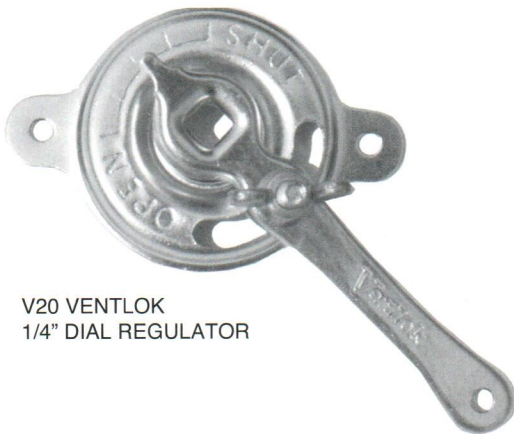
V20 VENTLOK 1/4" DIAL REGULATOR