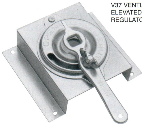
V37 VENTLOK 3/8" ELEVATED DIAL REGULATOR