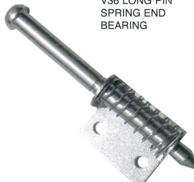
V36 LONG PIN SPRING END BEARING

This spring end bearing is designed for use on dampers in ducts insulated on the inside. The pin is one inch longer than our standard V35 spring end bearing, so that when released the pin extends 1-5/8" beyond the pin holder.