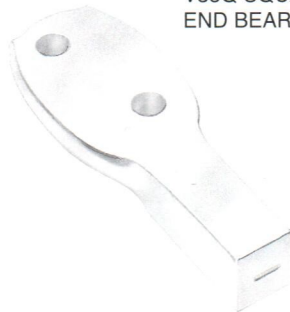
V35Q SQUARE END BEARING

This regulator is recommended for use on small dampers. You may order by sets or individual parts. A set consists of one dial regulator, one V20 square end bearing, and one V20 spring end bearing.